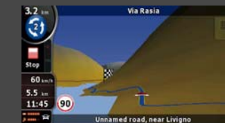
Modelling Terrain in 3D

While driving, hills and mountains are rendered in 3D to better represent your real-world driving environment. 3D landmark data is integrated seamlessly into the graphical rendering in 3D mode and does not block the view of POIs and other useful information.