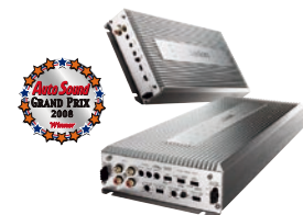
APA4360 180W x 4-ch Power Amplifier