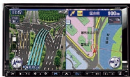
NX809 7-inch Wide VGA Screen-equipped Double-DIN Digital TV/DVD/HDD AV-Navigation System