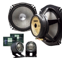
SRT1780S 17cm Separate 2-way Speaker System