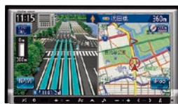
NX609 7-inch Wide Screen-equipped Double-DIN Digital TV/DVD/SDD AV-Navigation System